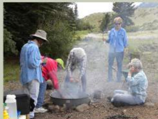
A few of the HAGS getting ready to roast hot dogs.

of us. But we meet somewhere in the area once a week to paint outside. Could be anywhere in the town itself or out at area guest ranches. Anywhere we think might be a good place . . . and close to where we want to have lunch! We also have at least one gathering to cook out over the campfire before we all head back to our winter homes. We have a lot of fun and I've learned so much from all of them.