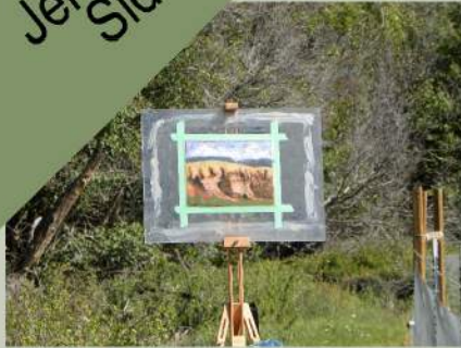
A painting I started last summer out at Antler's Guest Ranch