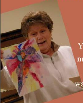
Yours truly filled everyone in on my adventures in collage and my attempts at trying to learn watercolor. Don't know if I'll ever get the hang of it!